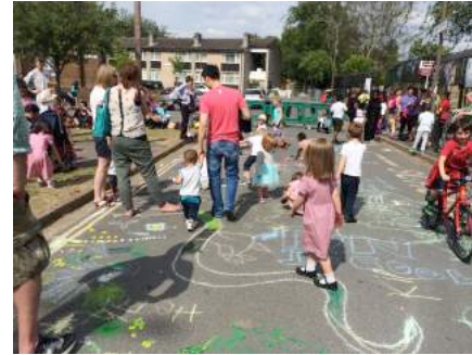
Road Safety Play Street