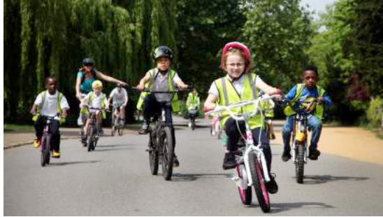
Cycling Trip and Skills Session

street that the local community support officers attended, presentations by the local schools police officers, TIE workshops and class based activities), inviting the families with children in the EYFS to a Safe Routes activity day at Herne Hill Velodrome and participating in the 'Big Shift' at Dulwich College, with our active travel ambassadors delivering an assembly on air quality to the College's Junior School.